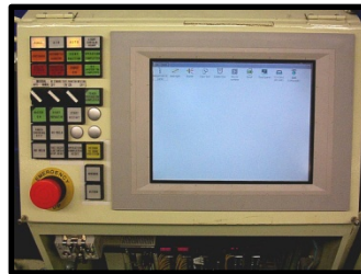
IDEC Monitor Touchscreen Control Panel