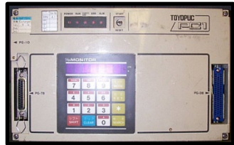
PC1 TPC-2060 with Integrated I/O Monitor Panel